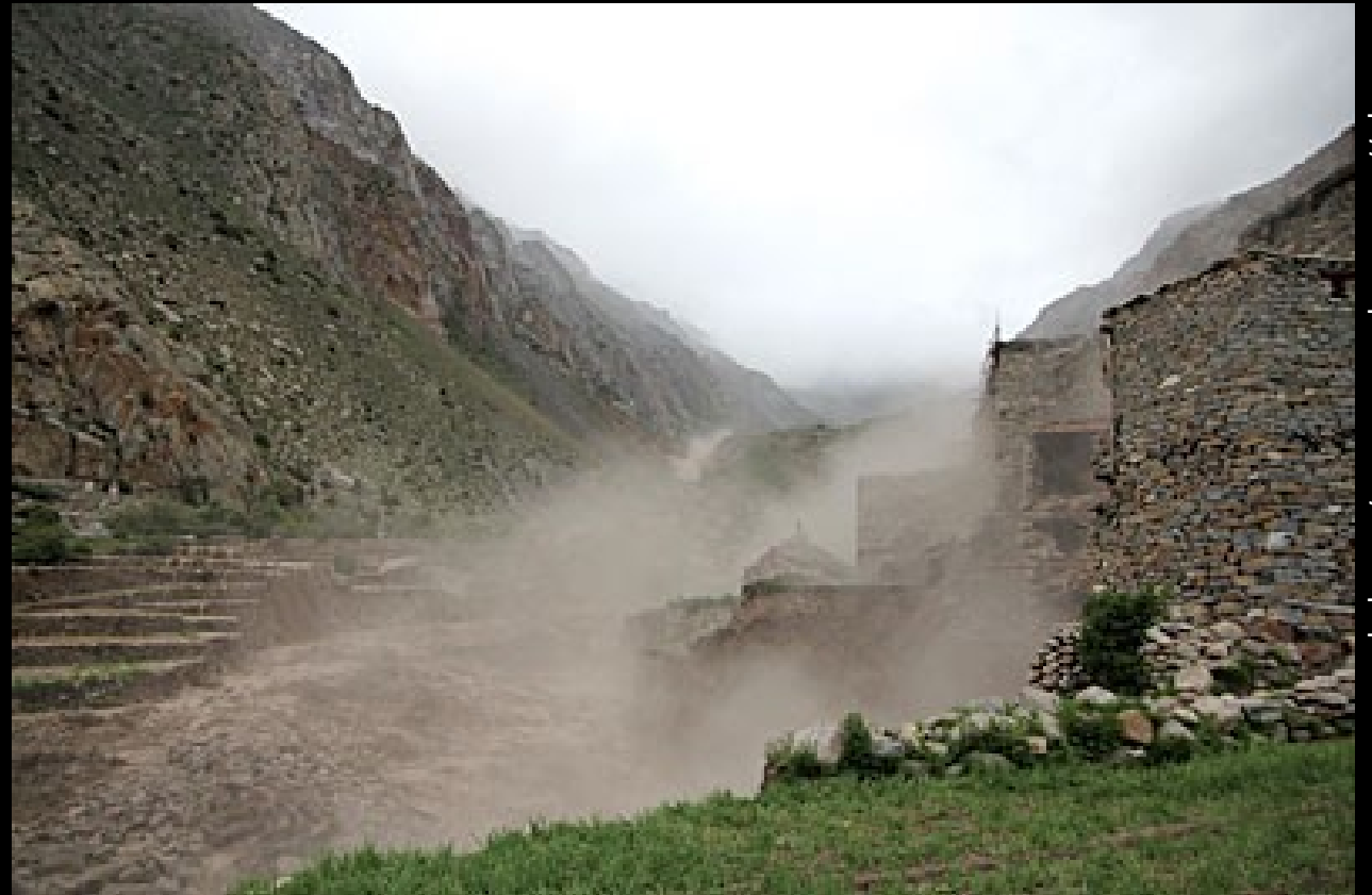
Glacial lake outburst flood in Humla District, Nepal Considered at low risk of GLOF by LAPA process