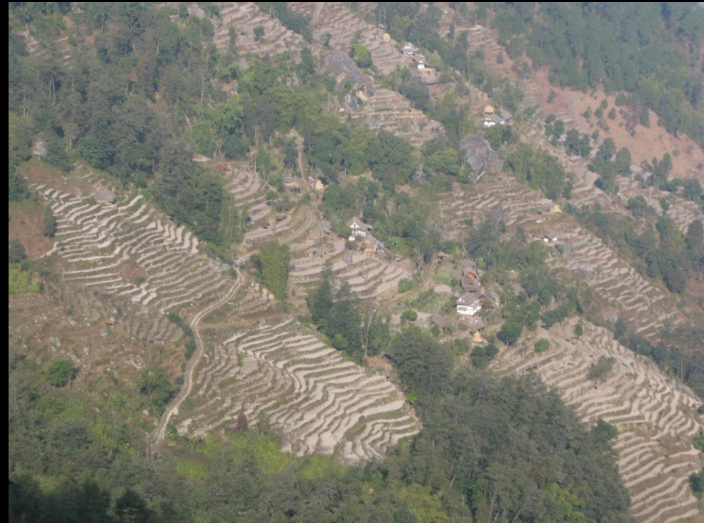
Winter dryness, east Nepal