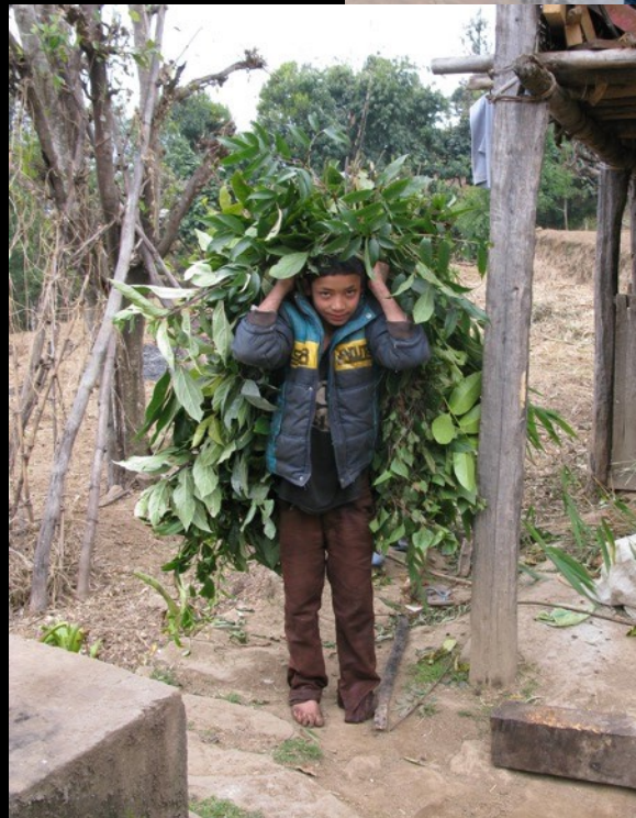
Young boy bringing fodder home