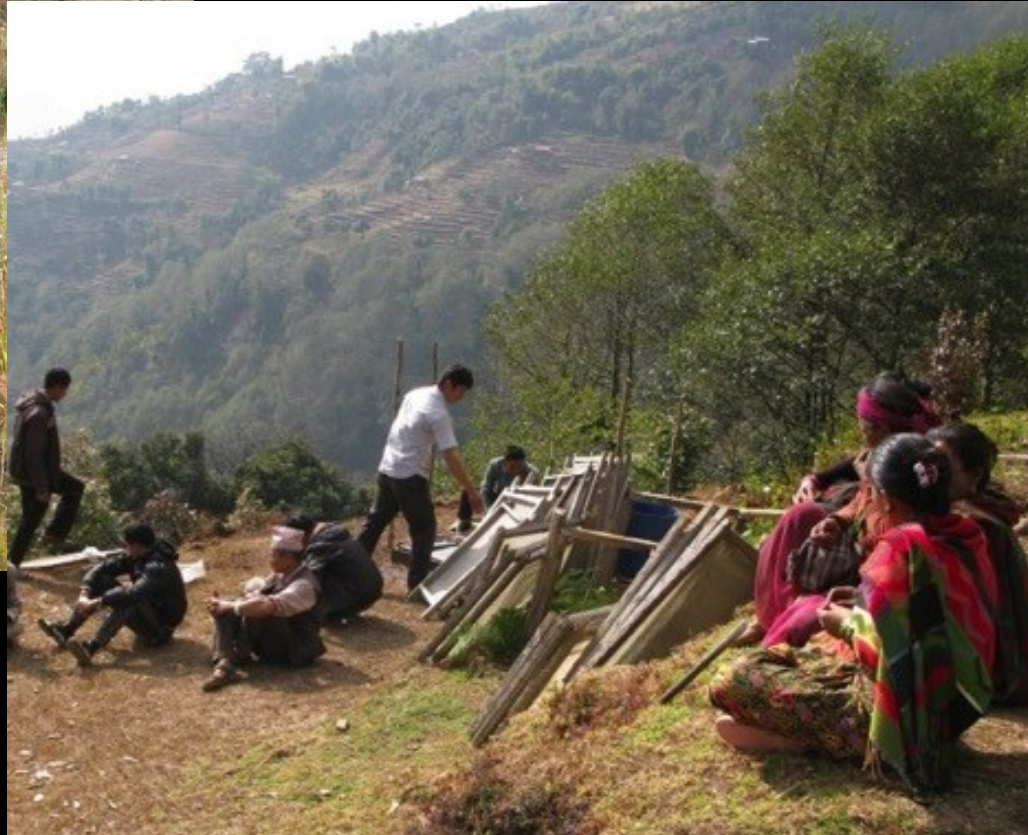
Handmade paper factory