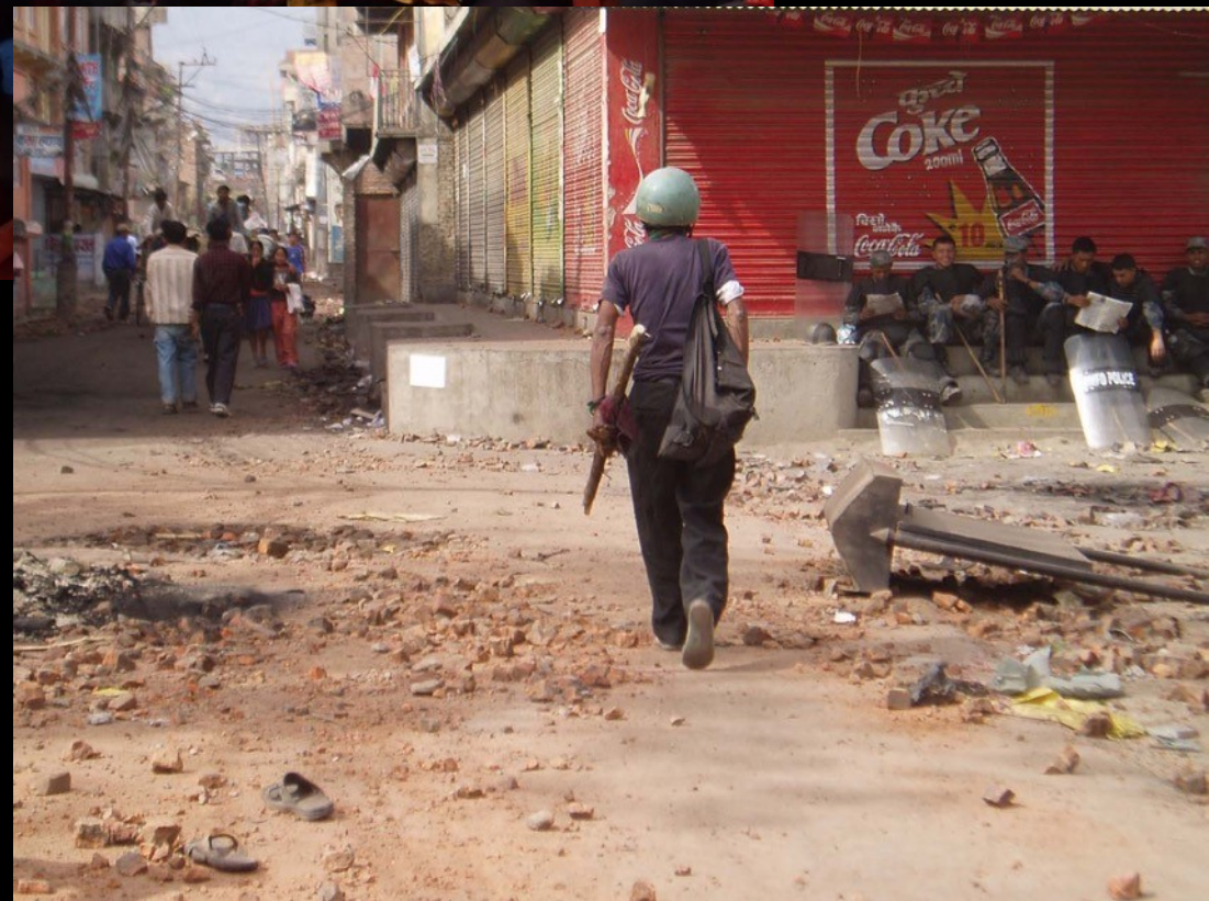
Aftermath of protests in Kathmandu 2006