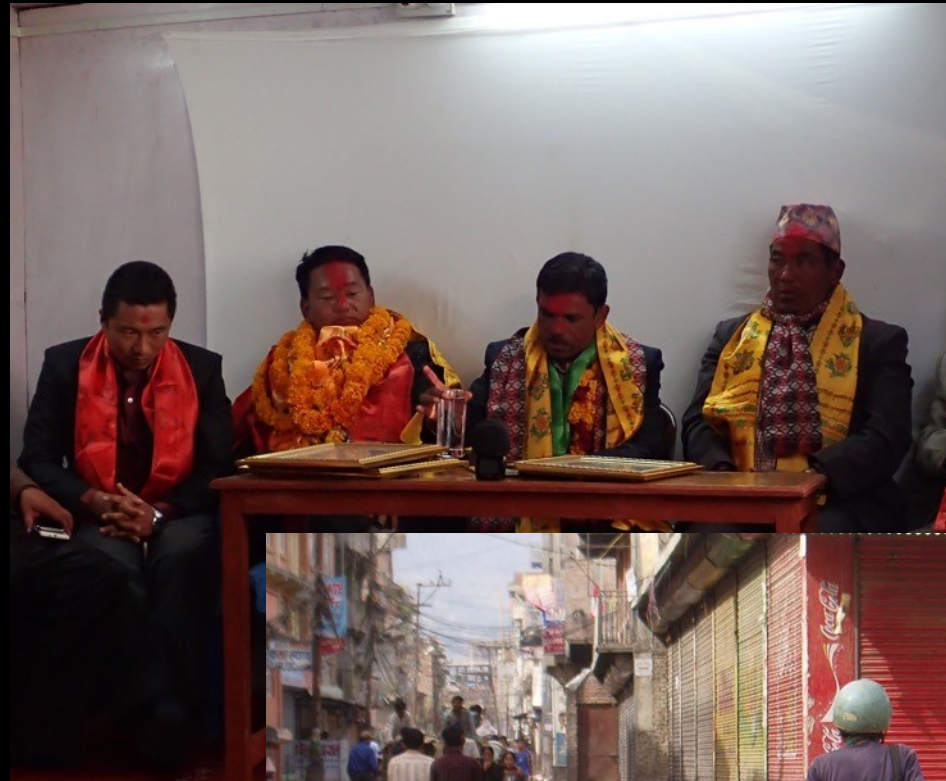
Newly elected municipality leaders 2017