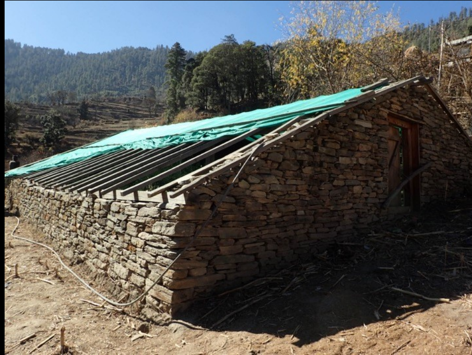
An unmaintained greenhouse