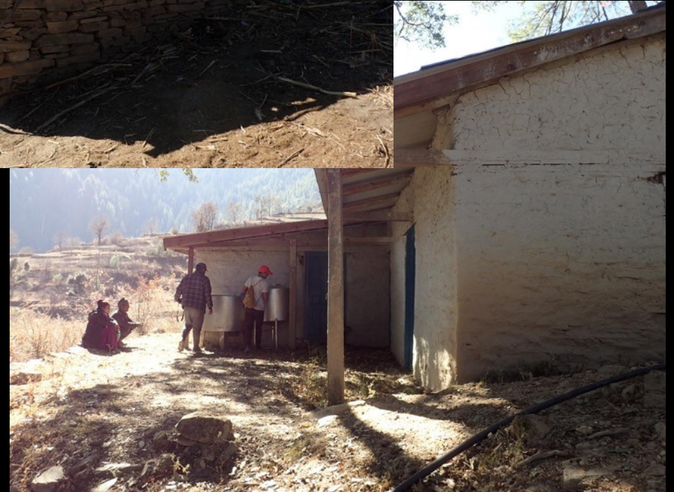
A cider press without electricity