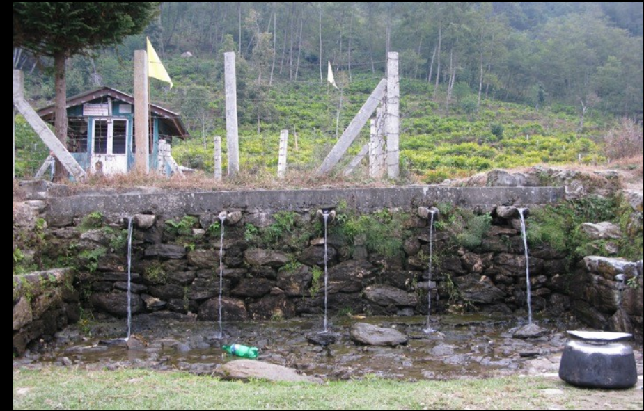
Traditional water taps, east Nepal