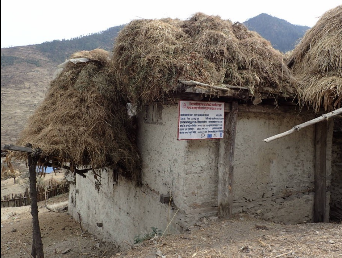
Sign board for drinking water LAPA program in Mugu District, west Nepal (now defunct)